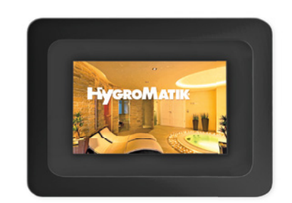
OPTIONAL: Spa Touch Control 5" touch display for external control